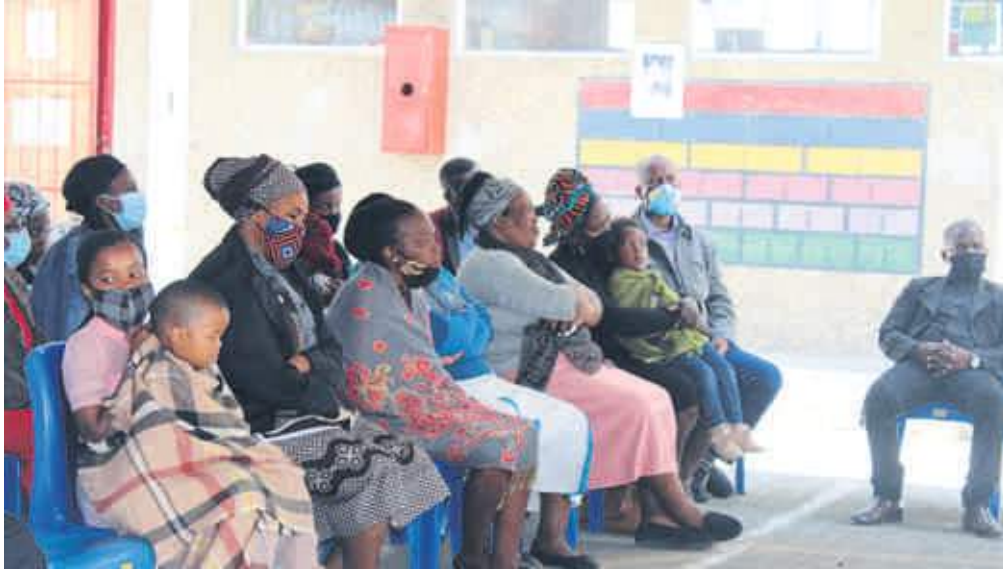
Izizalwane zalamakhwenkwe amabini ako BM acholwe kwichityana elikufutshane kuN2 ngoLwesine 22 kweyeDwarha eswelekile.

Usole amapolisa ngokurhuka iinyawo ngethuba kubikwa ukuduka kwala makh-