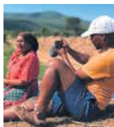
Aspiring filmmakers and storytellers are encouraged to enter their films.

▶ To submit your entry, visit https://belgian-chambersa.co.za/mmoca/ .