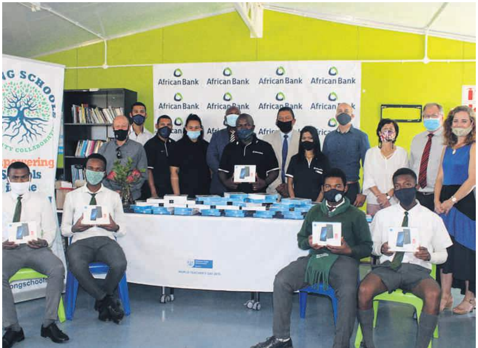
Learners, staff, African Bank personnel and Strong Schools with the 45 tablets donated to Nomzamo High School on Thursday 22 October.

thanked Strong Schools for their support, going back to 2016.