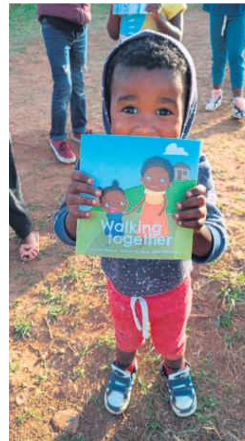
Book Dash will distribute its 1 millionth book this year.

● It's never too early to start reading with a child, so you can read with your baby too.