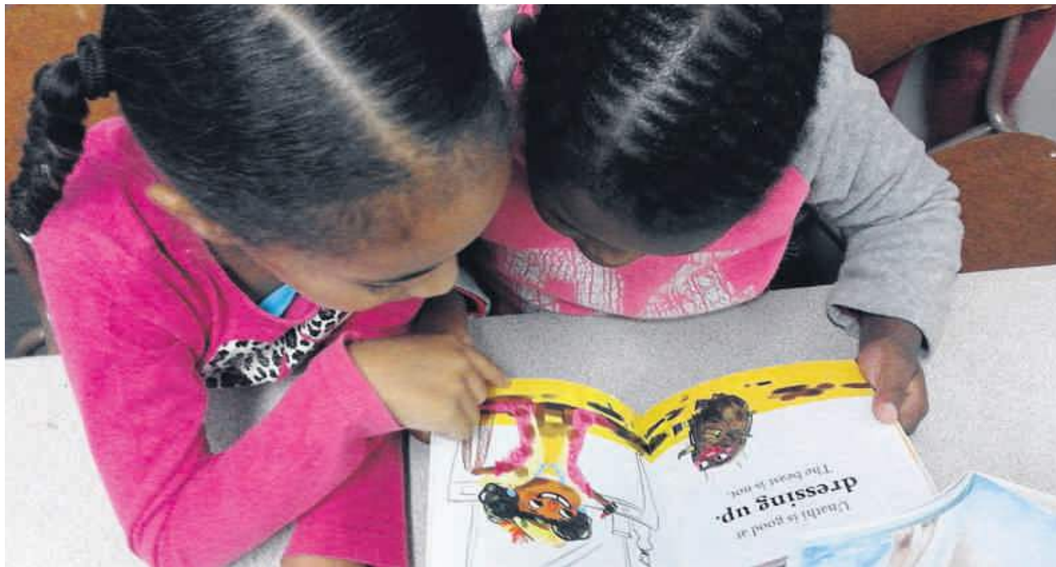
Distributing books to children is key in tackling literacy issues.

The Book Dash model cuts down about 80% of the normal publishing costs by har-