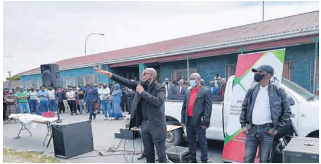
Deputy minister of State Security Zizi Kodwa addressing the community during a prayer service against people demanding protection fee from local businesses at Khayelitsha stadium.

She said prayer is the only weapon that can fix and heal the society. Mgyai vowed to continue having similar services until the community was free.