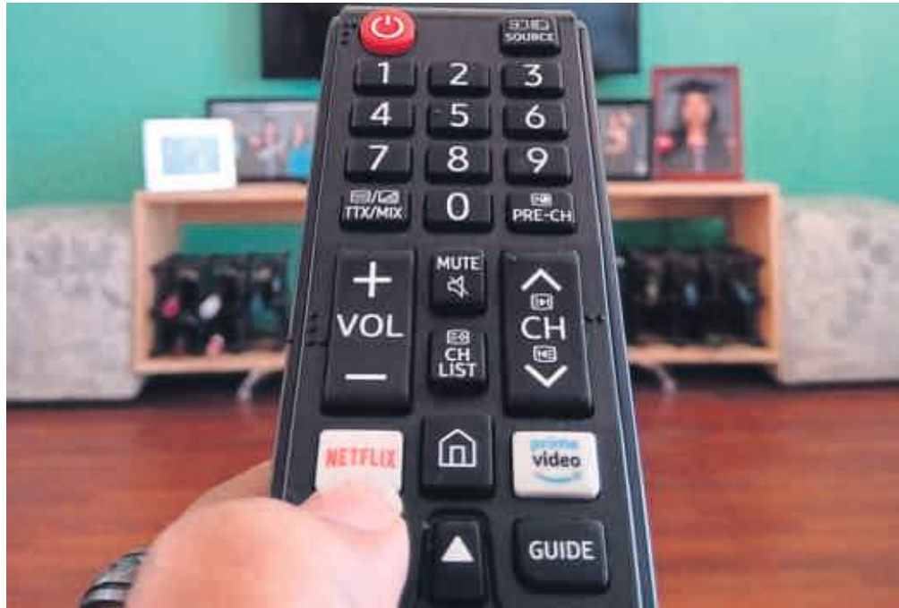
Users of live streaming services, regardless of whether they consume media on a computer, cellphone, tablet or TV, may be required to pay a TV license.

Kekana further stated that subscription streaming sites and pay-tv companies such as DStv should be liable to collect licencing fees.