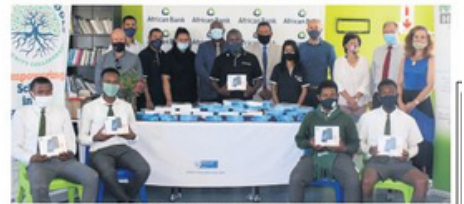
Staff and learners of Nomzamo High School, along with representatives of the Strong Schools

SSCC facilitates sustainable change in government schools in the basin. It designs and guide whole-school development journeys to build schools that are efficient and effective in its mandate of education to inspire transformation from spiraling generational cycles and a dwindling education system, to healthy, wholesome and hopeful futures for our society.