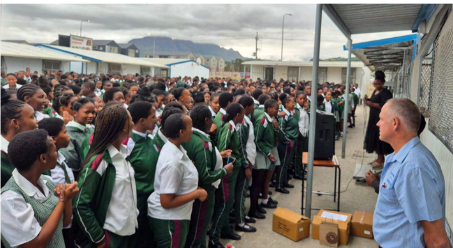
Gideon's Bible placement at Nomzamo High School