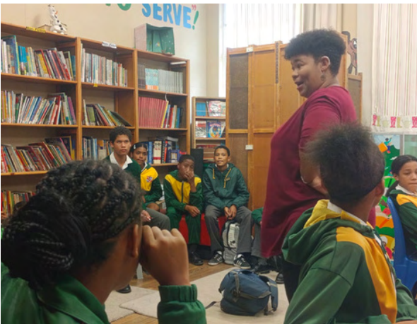
Life Skills at Dr GJ Joubert Primary

"I planted, Apollos watered, but God gave the increase. So then neither he who plants is anything, nor he who waters, but God who gives the increase. Now he who plants and he who waters are one, and each one will receive his own reward according to his own labor. For we are God's fellow workers; you are God's field, you are God's building." (1 Cor. 3:6-9)