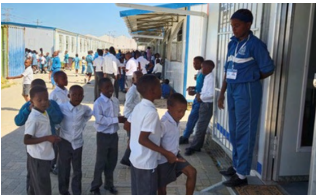
Prefects check that hands are clean for the library

Christmas Tinto Primary School in Asanda Village, next to the N2 in the Western Cape unveiled a brand-new 45 m 2 prefabricated school library on Thursday 23 November 2023. This was brought about through the Support Hub and Change Journey between the NPO SSCC and Christmas Tinto Primary. During the quarterly Support Hub meetings of June and August 2022, the principal raised the fact that the library space available at the school was not functional and insufficient to accommodate all the learners.