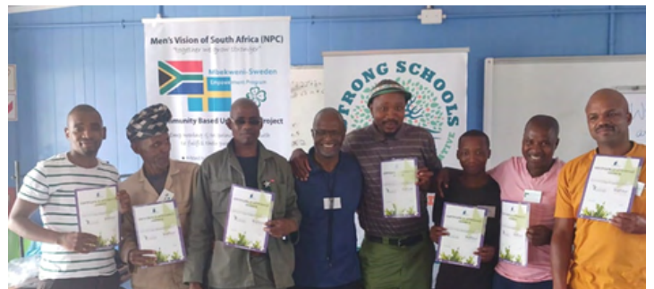
BrightStar Legacy Dad Programme