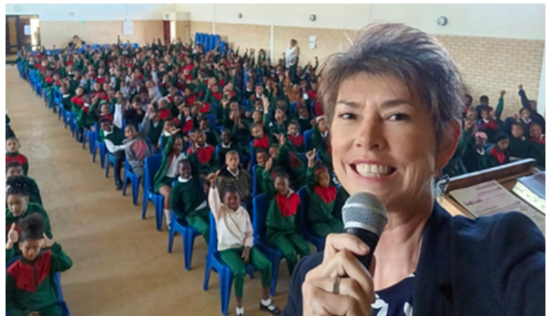
Assembly at Sir Lowry's Pass Primary