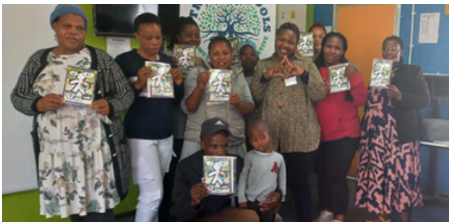
BrightStar First Light Programme for Parents