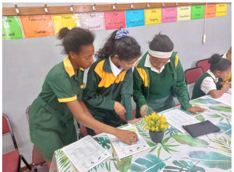
Reading is fun! Christmas Tinto Primary learners