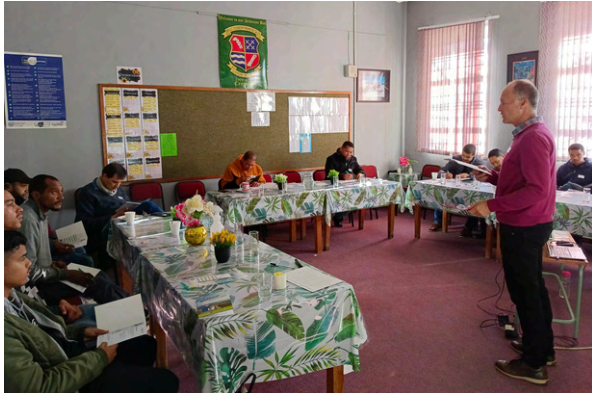
A Legacy Dad workshop