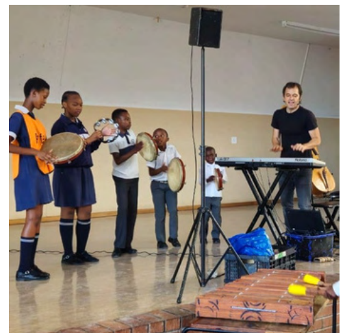
Therapeutic Music workshop at ACJ Phakade Primary School